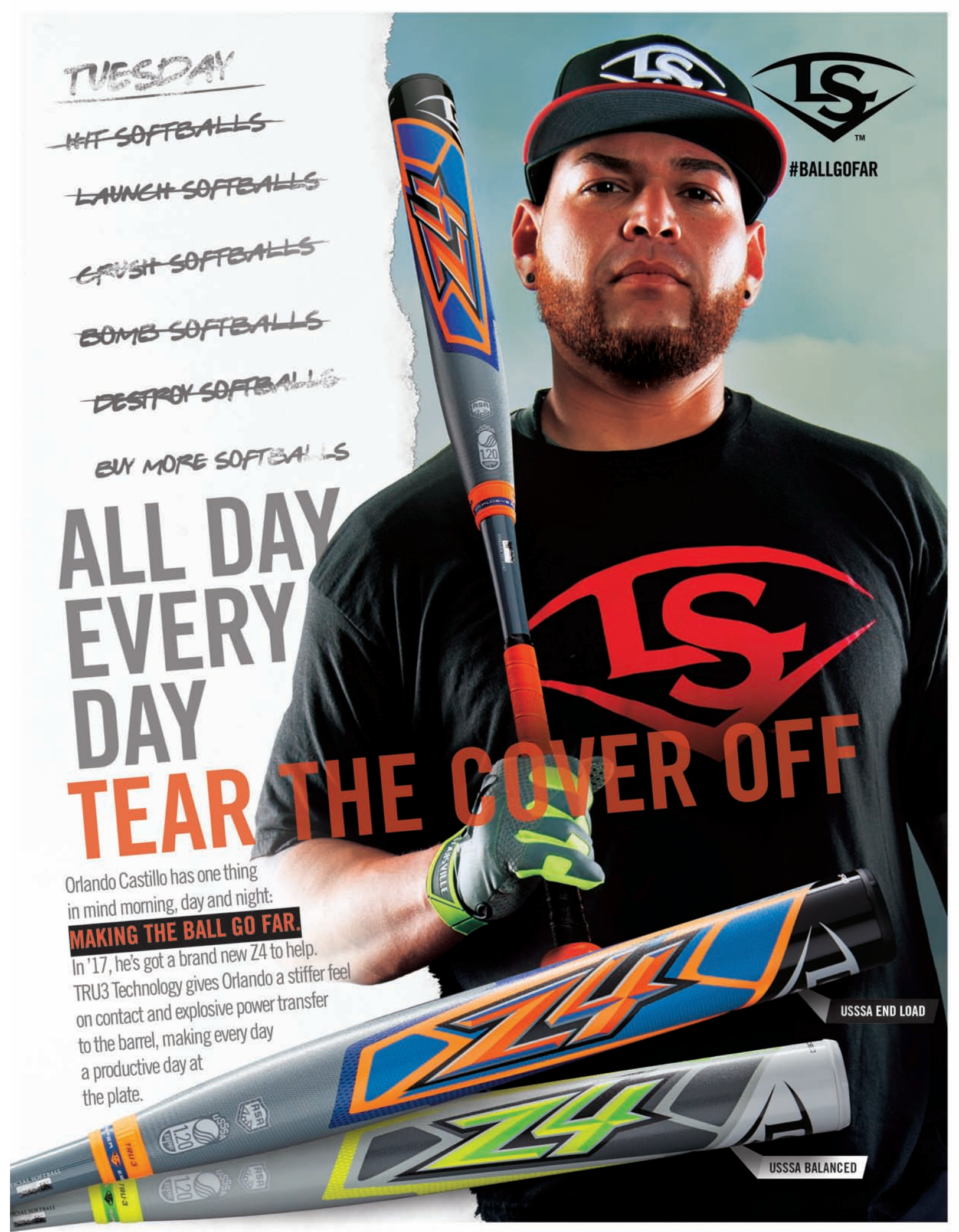
Page 10 • www.batwars.com • www.softballmag.com